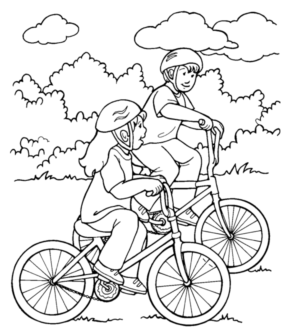
I can tell my friends about Jesus.

From Thru-the-Bible Coloring Pages for Ages 4-8. © Standard Publishing. Used by permission. Reproducible Coloring Books may be purchased from Standard Publishing, www.standardpub.com, 1-800-543-1301.